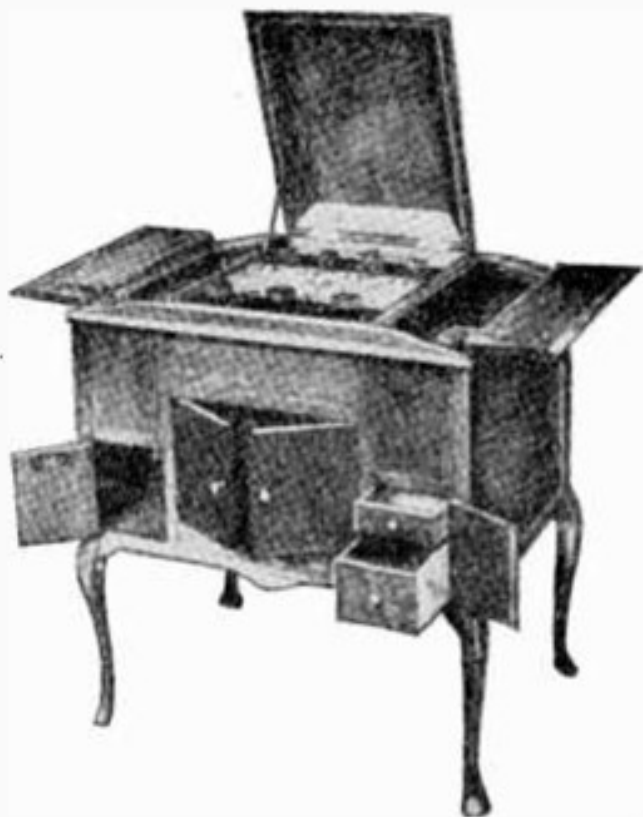
26. 'Improved Styles'

'Cabinet-work in any period, batteries all enclosed. All British and most continental stations on head- phones and most on the cunningly incorporated loudspeaker.'