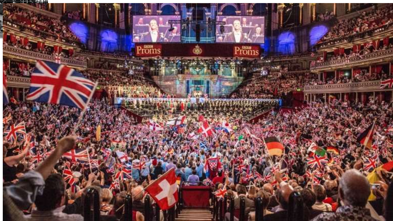
The BBC Proms 1927, 2019