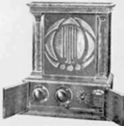
Celestion Cabinet Radio Receiver.

London Showroom: 21, Villiers Street, Strand, W.C. 2. Phone: Gerrard 0597.