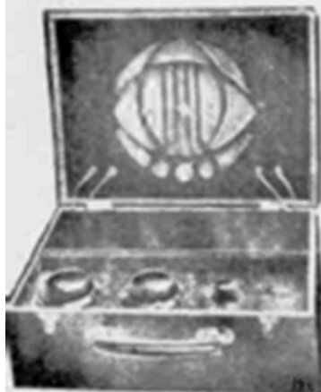
Celestion Portable Radio Receiver.

pioneers of the Cabinet Large Controlled Diaphragm Loud Speaker and Self-contained Balanced Signal Radio Receivers invite you to inspect their at inventions which are an outstanding feature of the Exhibition. Celestion Products reign supreme for originality, highest grade workmanship, beauty of design and results of outstanding merit.